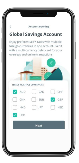
Multi-Currency account and debit card